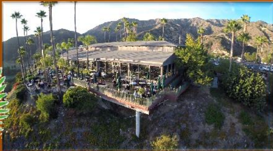
The Castaway Restaurant 1250 E. Harvard Road, Burbank California