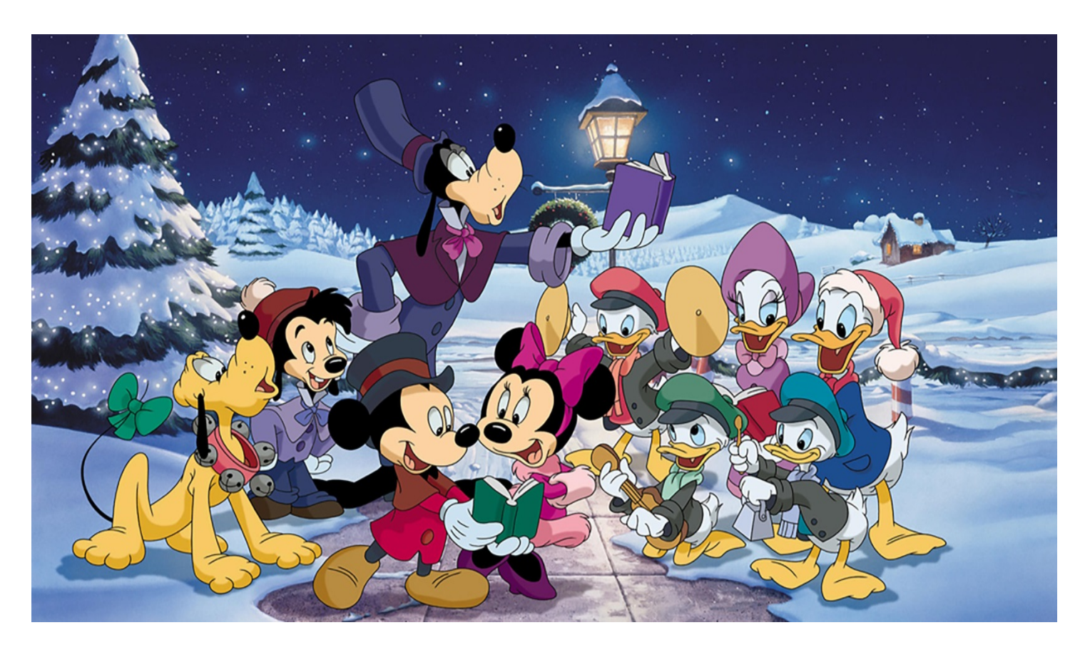
Come Kick off your Holiday Season

The Disneyland Resort Hotels Group Travel Operations is pleased to provide reservation assistance for the SCSNA Chapter Meeting, arriving Friday, November 30, 2018 at Disney's Paradise Pier Hotel.